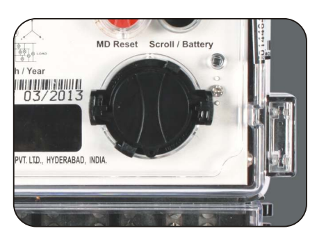
Optical Communication Port