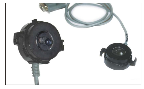
Meter Reading Software 36MS