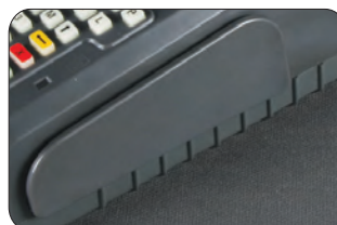
Magnetic Swipe Card Reader