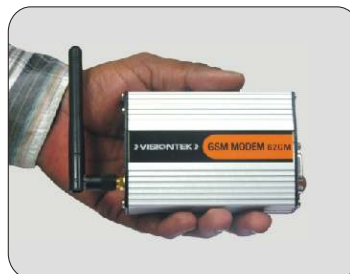
Small Foot Print