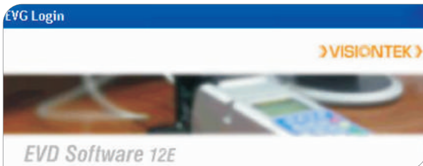
EVD Login Screen

Visiontek through its readily available software inventory and development expertise can deliver quality software to our customers as per the requirements. Our software expertise spectrum spans connectivity technologies such as GSM/CDMA/PSTN/IP and Wi-Fi for various targeted segments.