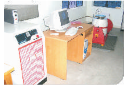
Vibration Analysis Lab