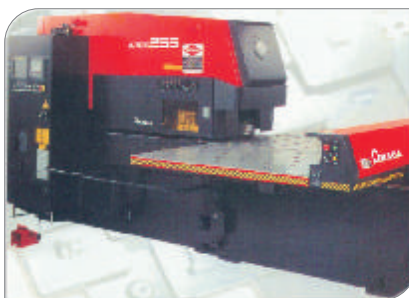
CNC Turret Punch Press