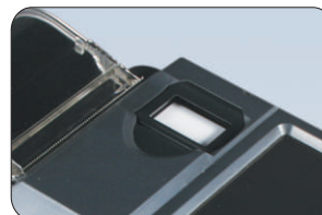
Finger Print Scanner