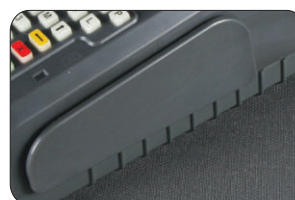
Magnetic Swipe Card Reader